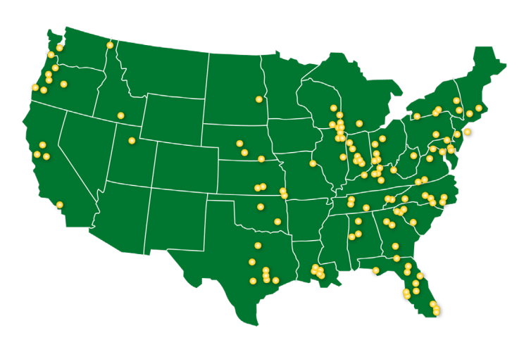
Figure 3. IAC Assessments Nationwide, July - September 2019

Plants assessed were located in 33 states (Figure 3). The assessed plants represent a broad range of industries, with fabricated metals and food being the most common (Table 2).